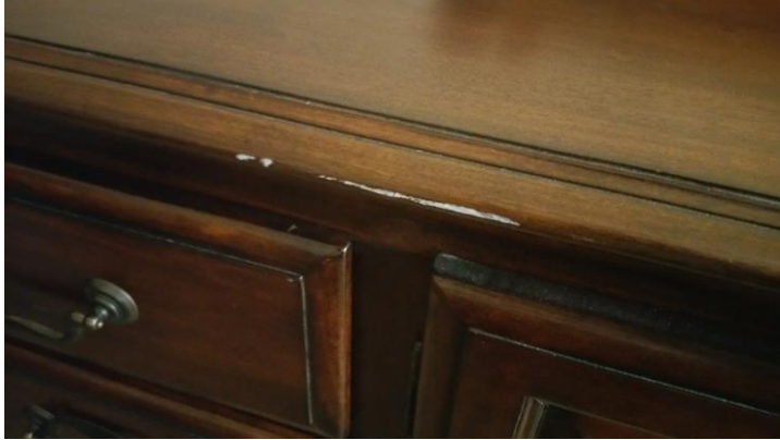
Scraped dresser on recently painted doorway where they chose to enter the laundry room instead of the front door.