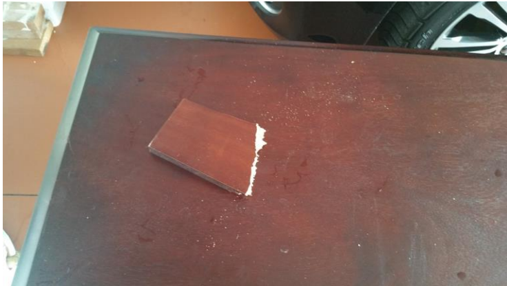
TV Stand with two unrepairable broken legs

We will give it a couple more days and then we will go to plan B with the legal team and the BBB.