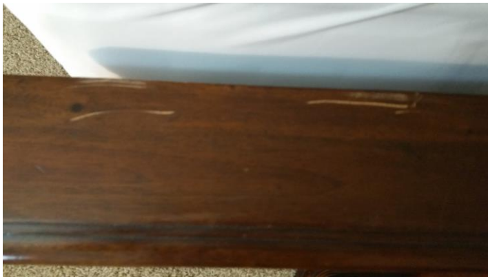
Gouges and scratched to the foot-board