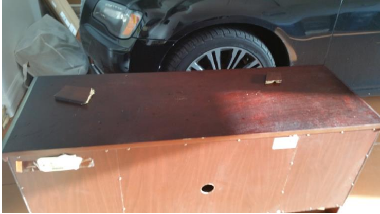
Different view of the 60" TV stand credenza