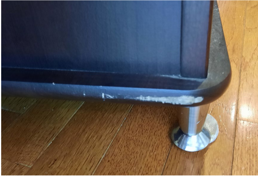
5. Small night stand beside sofa: The corner wood seriously damaged