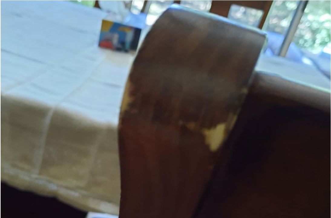
7. Shelf in the bedroom: Corner wood badly scratched