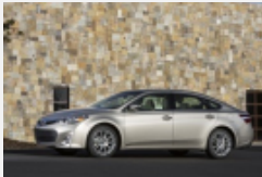
2013 TOYOTA AVALON