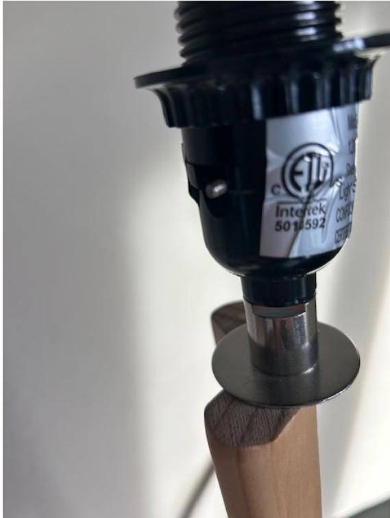
Broken Lamp - Missing Knob and Structural Damage