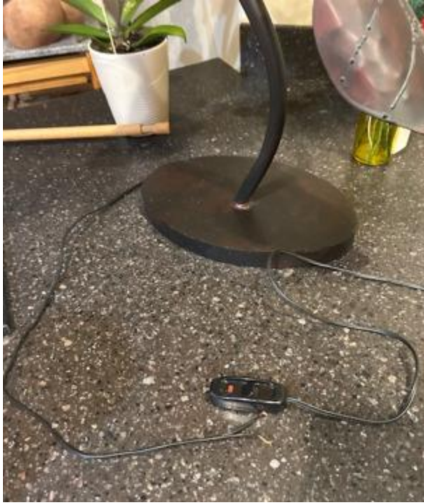
Item #3: Broken Electric Cord on Designer Lamp