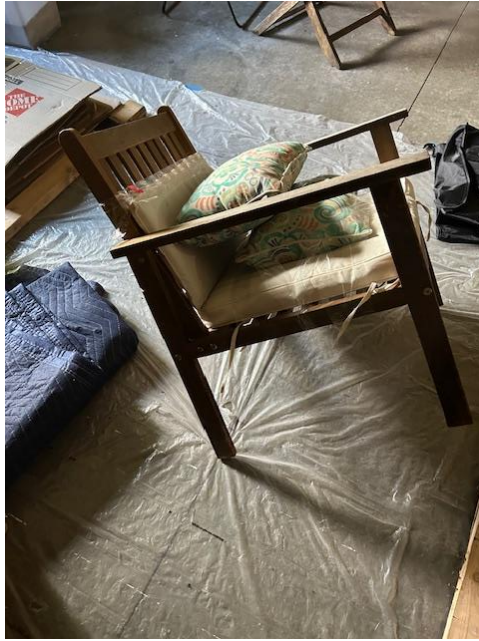
Item # 13: Outdoor Furniture – 3 pc Patio Set, damaged