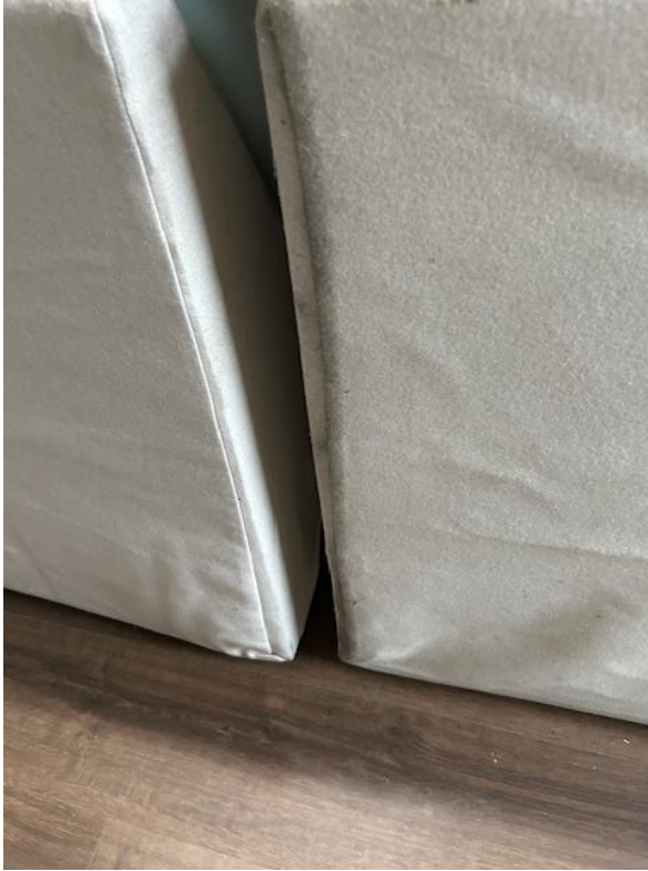
Item # 7: 3-piece sectional with water damage, and covered in oily dirt