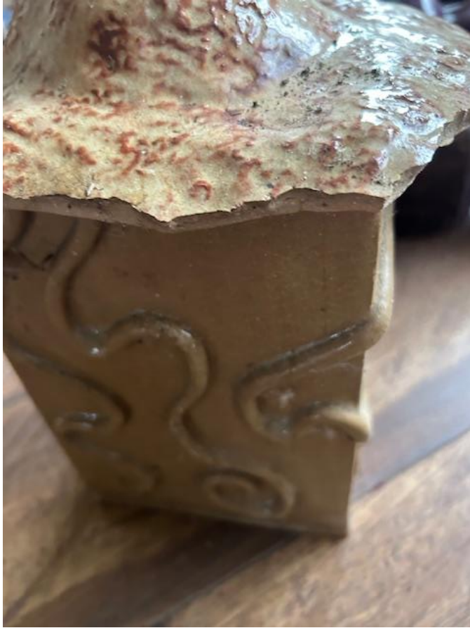
Item # 8: Handmade Birdhouse – broken

all of the decorative edges were broken off