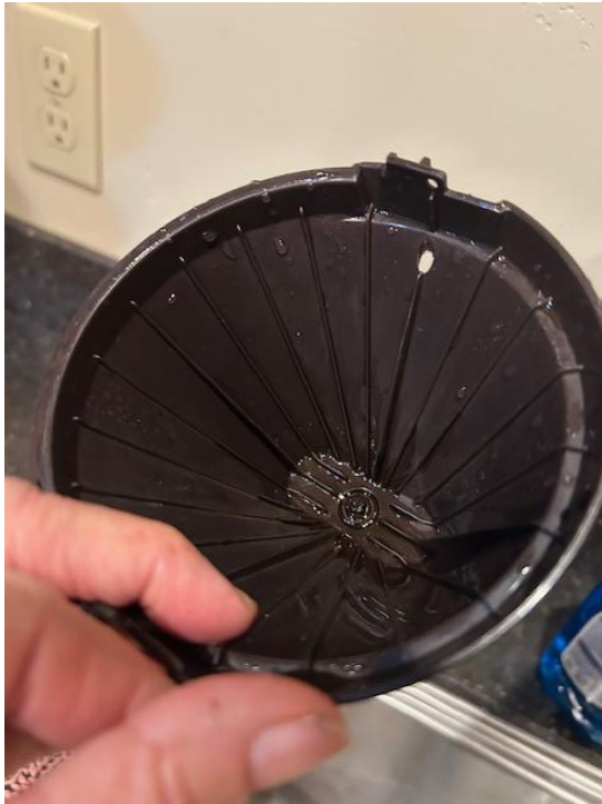
Item #6: Damaged coffee maker basket - handle missing