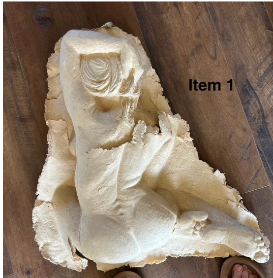
Item #1: Professional One-of-a-Kind Original Sculpture

Damage to both front and back of sculpture