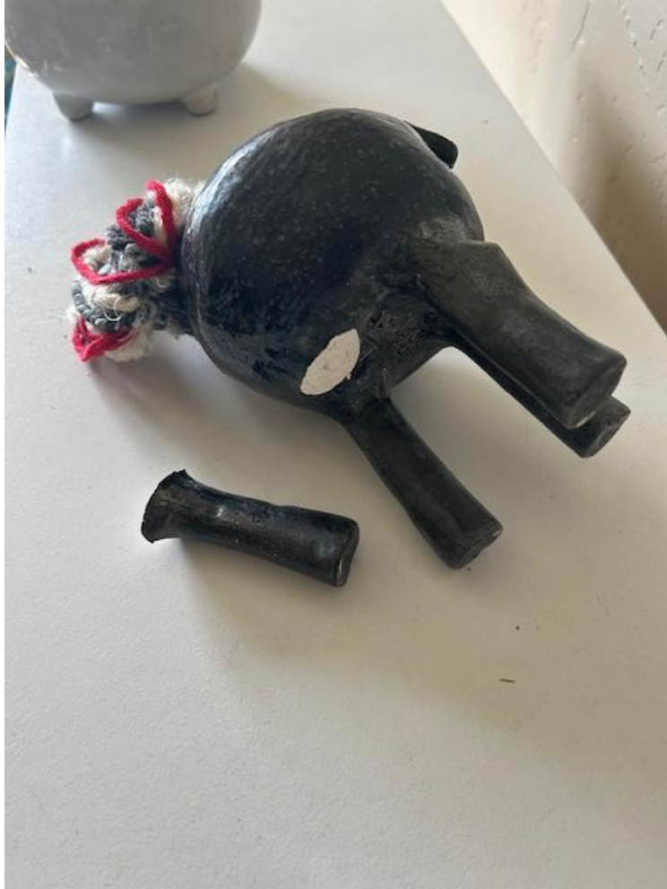
Item # 10 : Small Sculpture – Broken