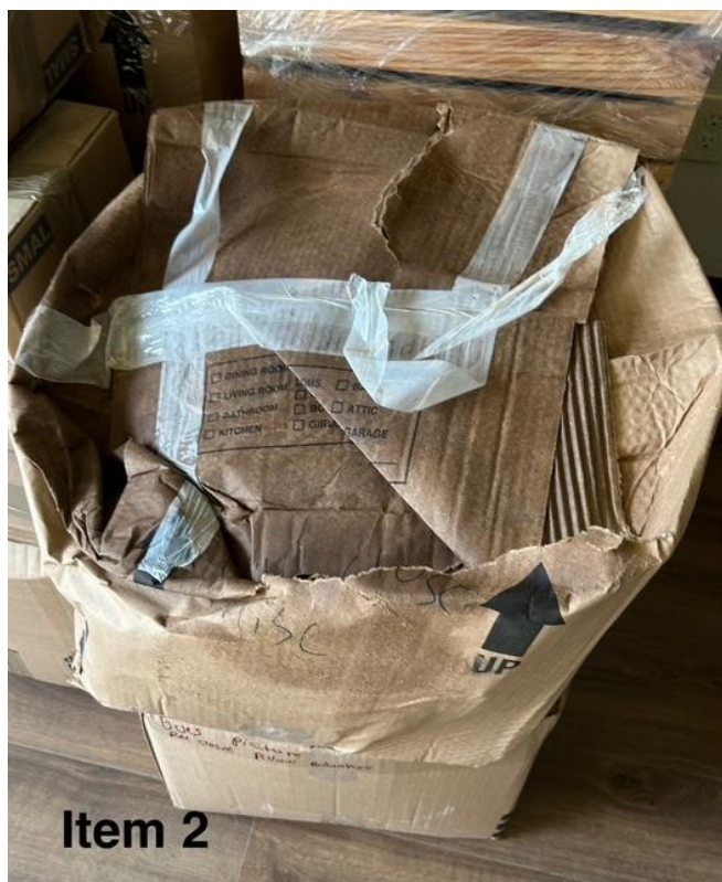
Item #2: Box of linens – arrived soaking wet