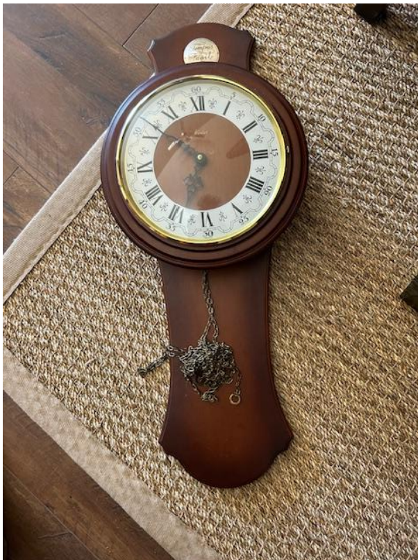
Item #4: Antique Clock

Chains have been pulled out and off the sprocket.