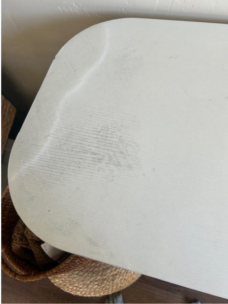
Item #9: Sewing Machine Table – Wet and Warped