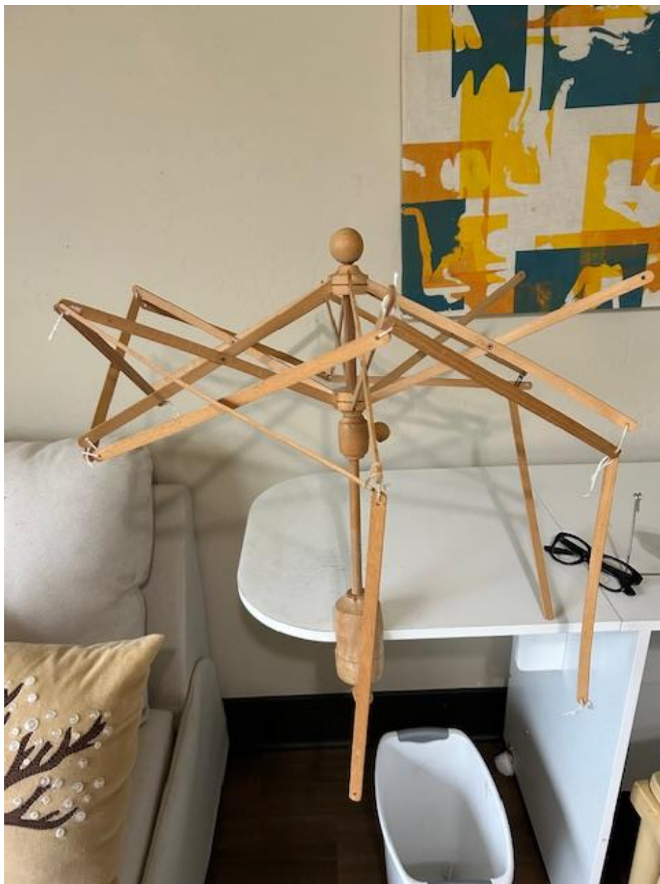
Item # 12: Weaving Tool - Broken